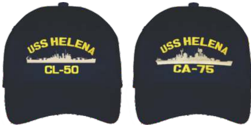
CA-75, or CL-50 Caps - $20.00