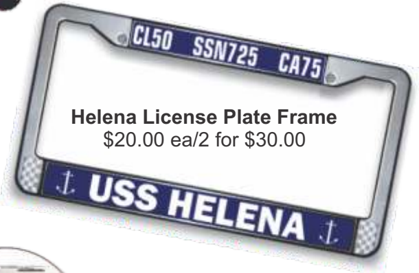
Helena License Plate Frame $20.00 ea/2 for $30.00