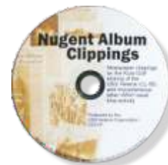
Nugent Album CD $10.00