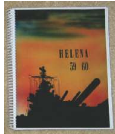
Spiral Bound Copies of CA-75 Cruise Books - 1951, '53, '53", or '54 - $25.00 ea. 1956, or '57 - $30.00 ea. 1958 - $45.00 1959/60 - $60.00 1960/61 - $50.00