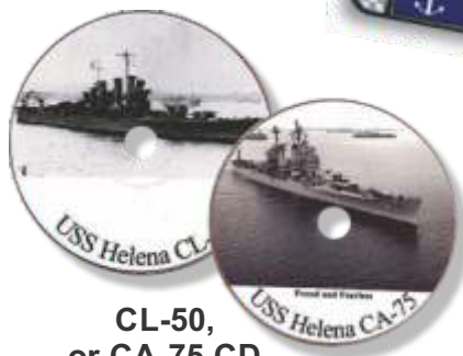
CL-50, or CA-75 CD $10.00